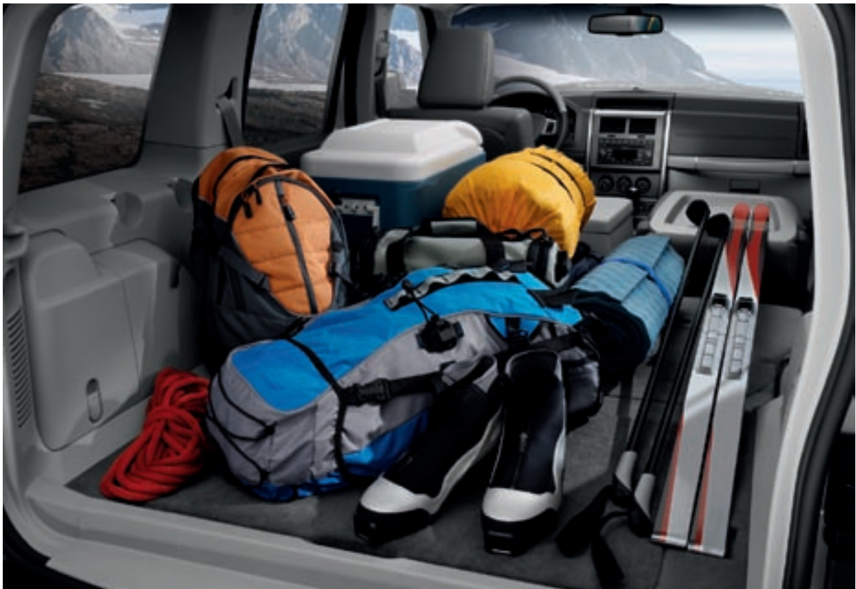
Jeep® Cherokee offers flexible seating and cargo options

(1) A range of vehicle curb weights is provided. Actual curb weight depends upon vehicle's equipment.