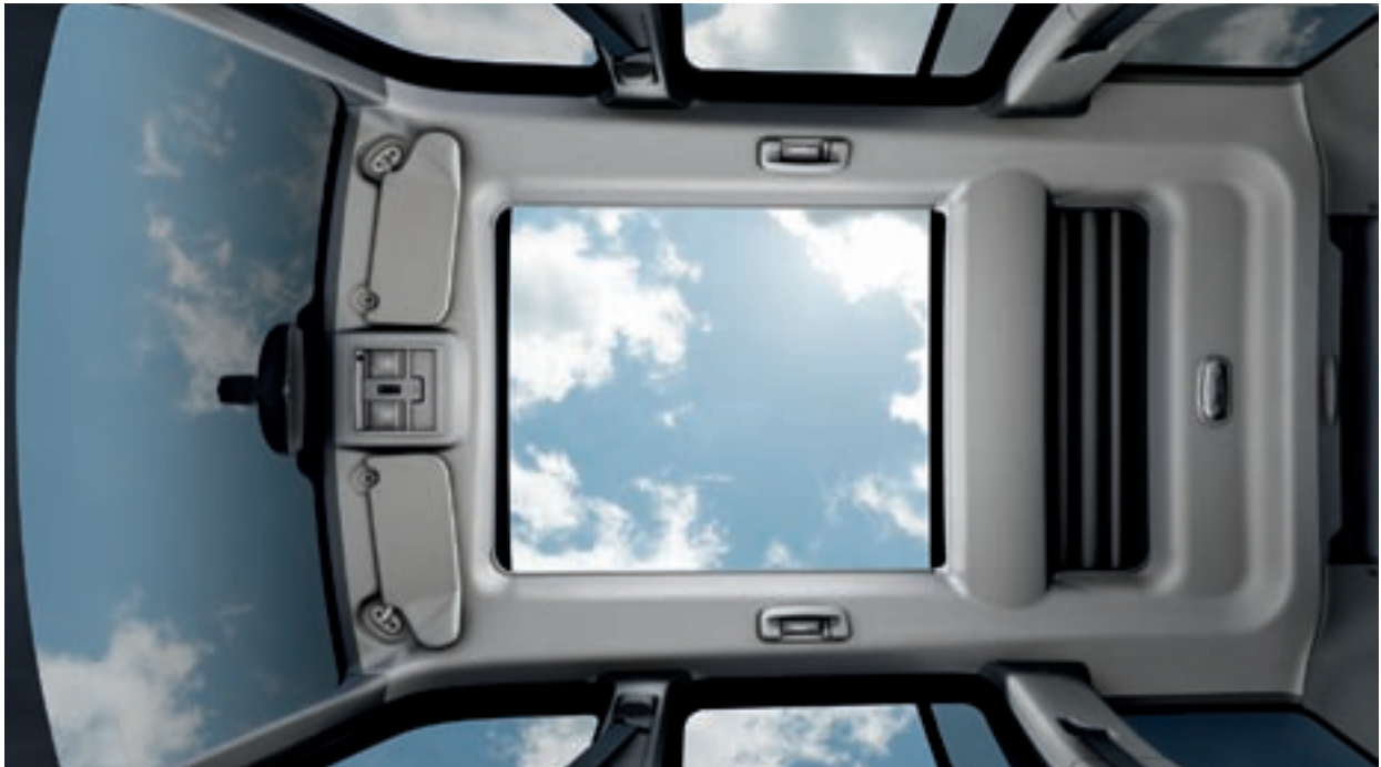
Industry-Exclusive Sky Slider™ Retractable Roof

(5) Not compatible with aftermarket fabric-protecting coatings.